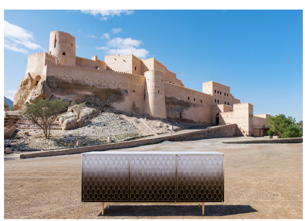
3 Door Monochrome Nizwa Cabinet in Omani fortification

I love working with Omani craftspeople - their techniques are incredible. Reinterpreting what they do for a contemporary and global audience offers a rare opportunity to champion skilled craftsmanship.