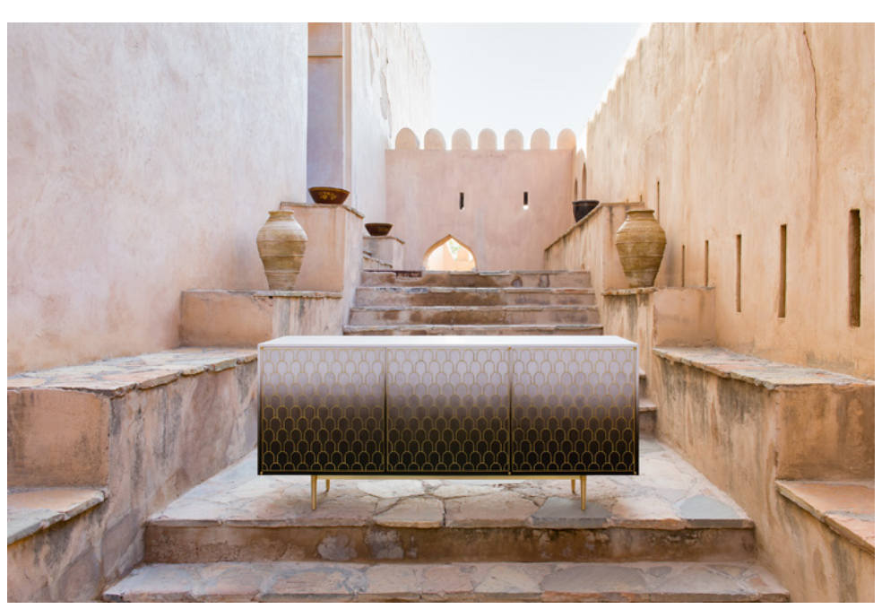
3 Door Monochrome Nizwa Cabinet in Omani fortification

'On my travels I come across so many incredibly skilled artists and makers in industries that deserve to be nurtured, celebrated and supported,'