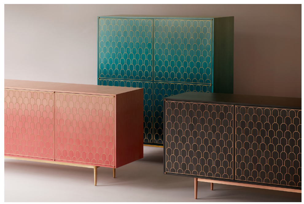
Cabinetry showing brass and copper finishes

I love working with Omani craftspeople - their techniques are incredible. Reinterpreting what they do for a contemporary and global audience offers a rare opportunity to champion skilled craftsmanship.