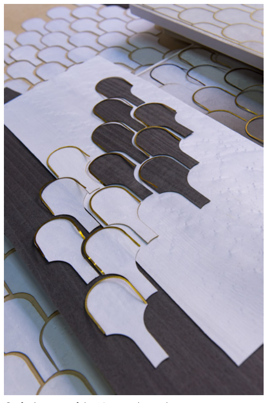
Craft elements of the Nizwa cabinet showing marquetry techniques

'On my travels I come across so many incredibly skilled artists and makers in industries that deserve to be nurtured, celebrated and supported,'