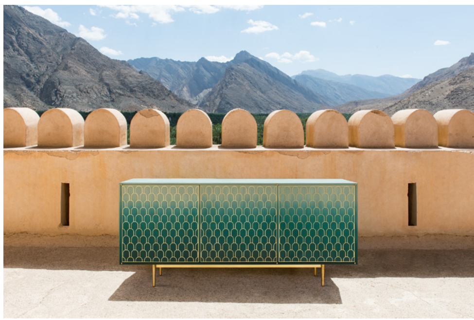
3 Door Jade Nizwa Cabinet in Omani fortification