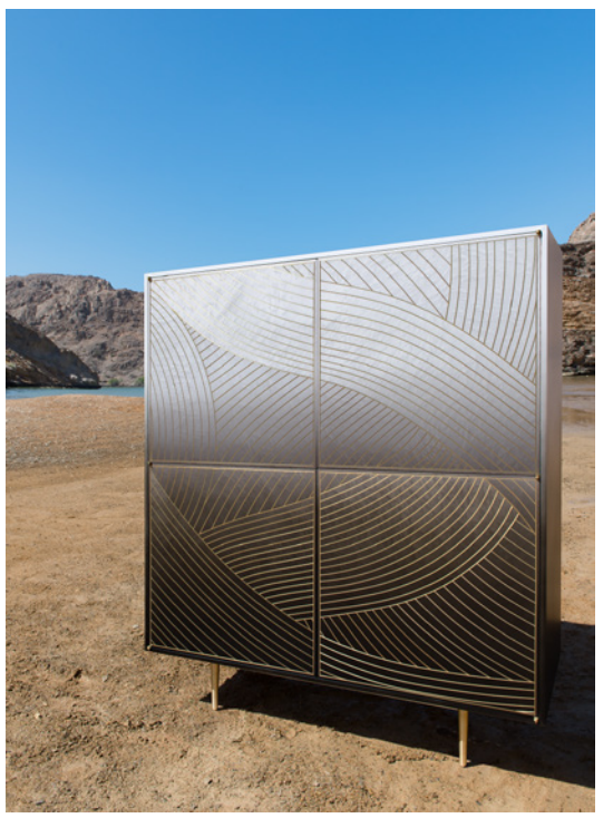
4 Door Monochrome Dhow Cabinet on Omani beach

Even the most complex pattern becomes calm, balanced and harmonious when you get it just right. I think my instinct for geometry comes from my ancestor's travels through India, Arabia and Persia.'