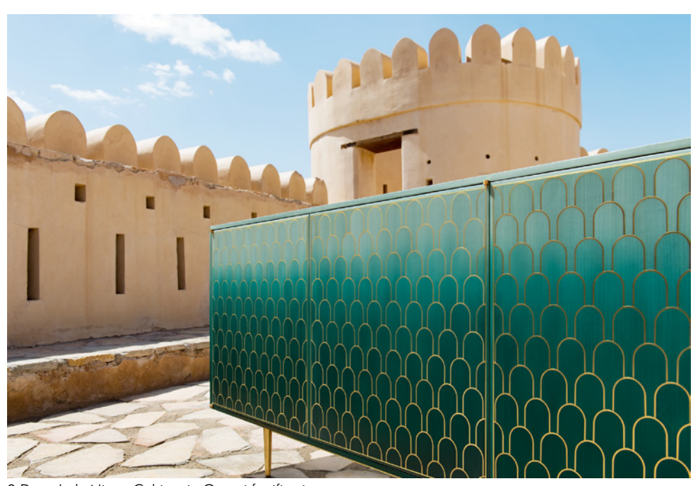
3 Door Jade Nizwa Cabinet in Omani fortification

'My family heritage and my own travels and research continually draw me back to Middle Eastern art and culture as a source of inspiration.'