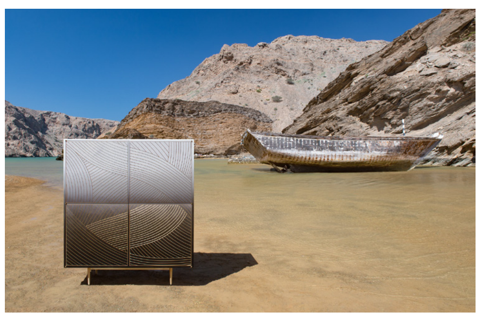
4 Door Monochrome Dhow Cabinet on Omani beach with shipwrecked Dhow sailing boat

Award-winning Welsh designer Bethan Gray is launching new colours, finishes and materials for the Shamsian Collection of furniture, inspired by the fort at Nizwa and traditional Dhow boats.