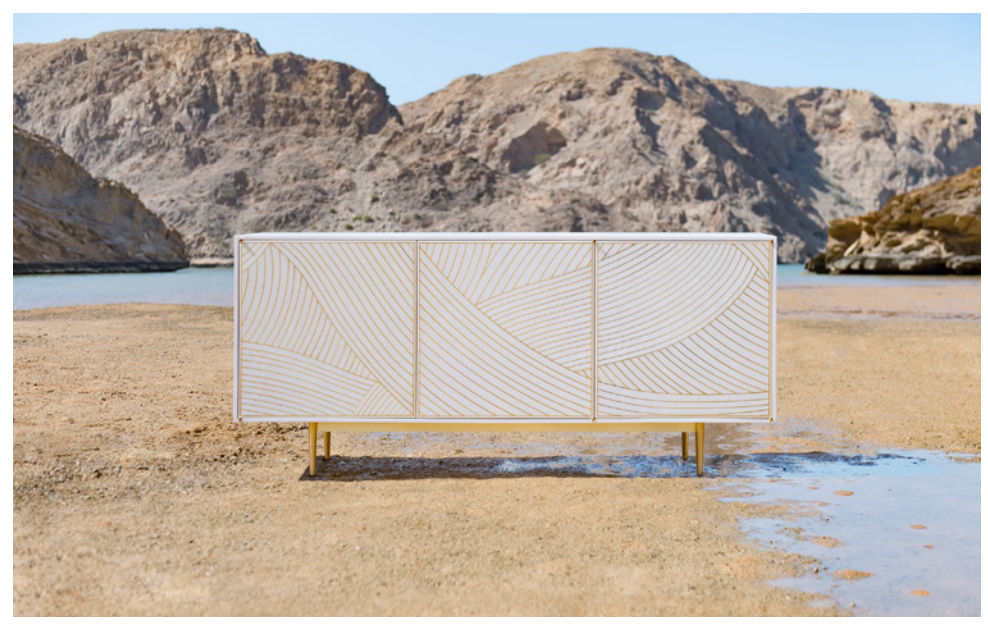
3 Door White Dhow Cabinet on Omani beach

'My family heritage and my own travels and research continually draw me back to Middle Eastern art and culture as a source of inspiration.'